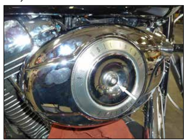
2. Remove the Allen screw that attaches the air filter cover.