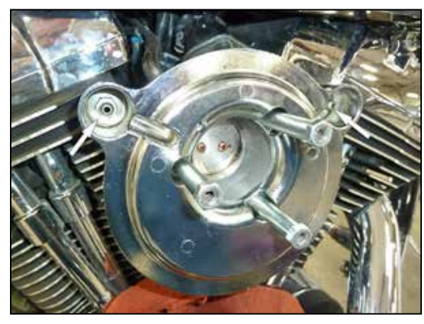
5. Remove the two rubber vent adapters from the vent bolts and then remove the two vent bolts.