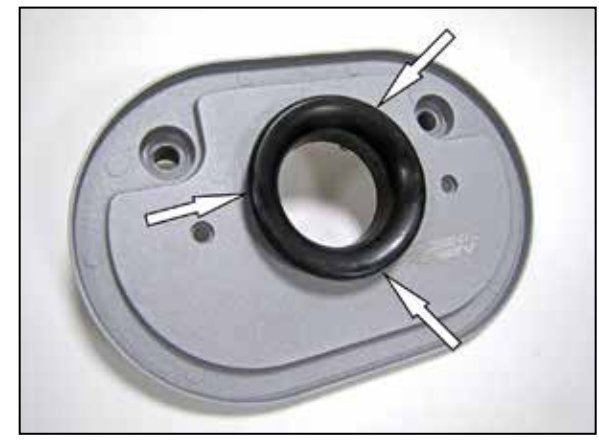
7. Install the provided intake velocity stack and the three throttle body bolts in the K&N® back plate.