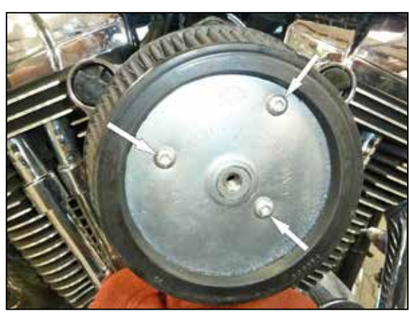
3. Remove the remove the three Torx screws that attach the air filter.