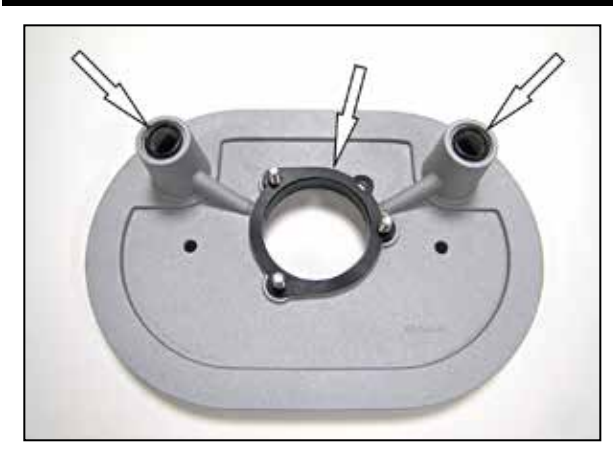
8. Install the remaining two O rings and the two filter spacers onto the front of the K&N® back plate as shown using the provided hardware.