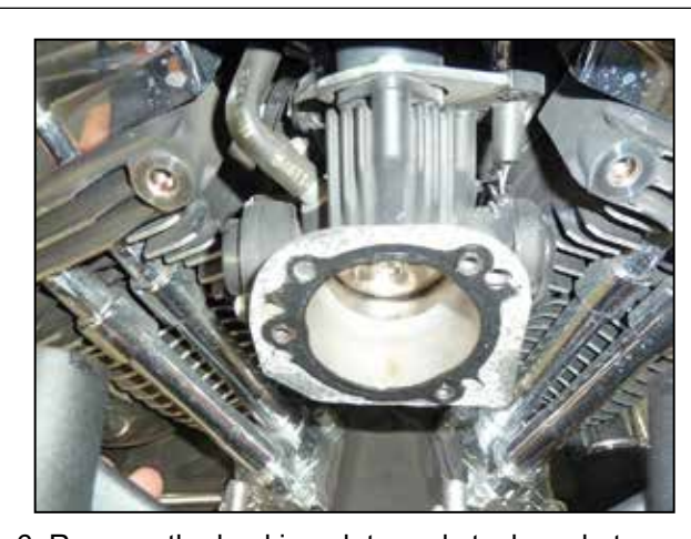
6. Remove the backing plate and stock gasket. NOTE: K&N Engineering, Inc. recommends that customers do not discard the factory air intake components.