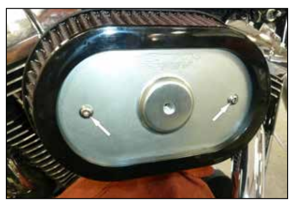
10. Place the K&N® filter on the back plate and attach with the remaining button head screws. NOTE: Apply one drop of provided thread locker to each screw.

NOTE: Due to manufacturer tolerances, it maybe necessary to use the provided spacers so the base plate seats properly on the throttle body and cylinder heads. Place one drop of thread locker onto each bolt.